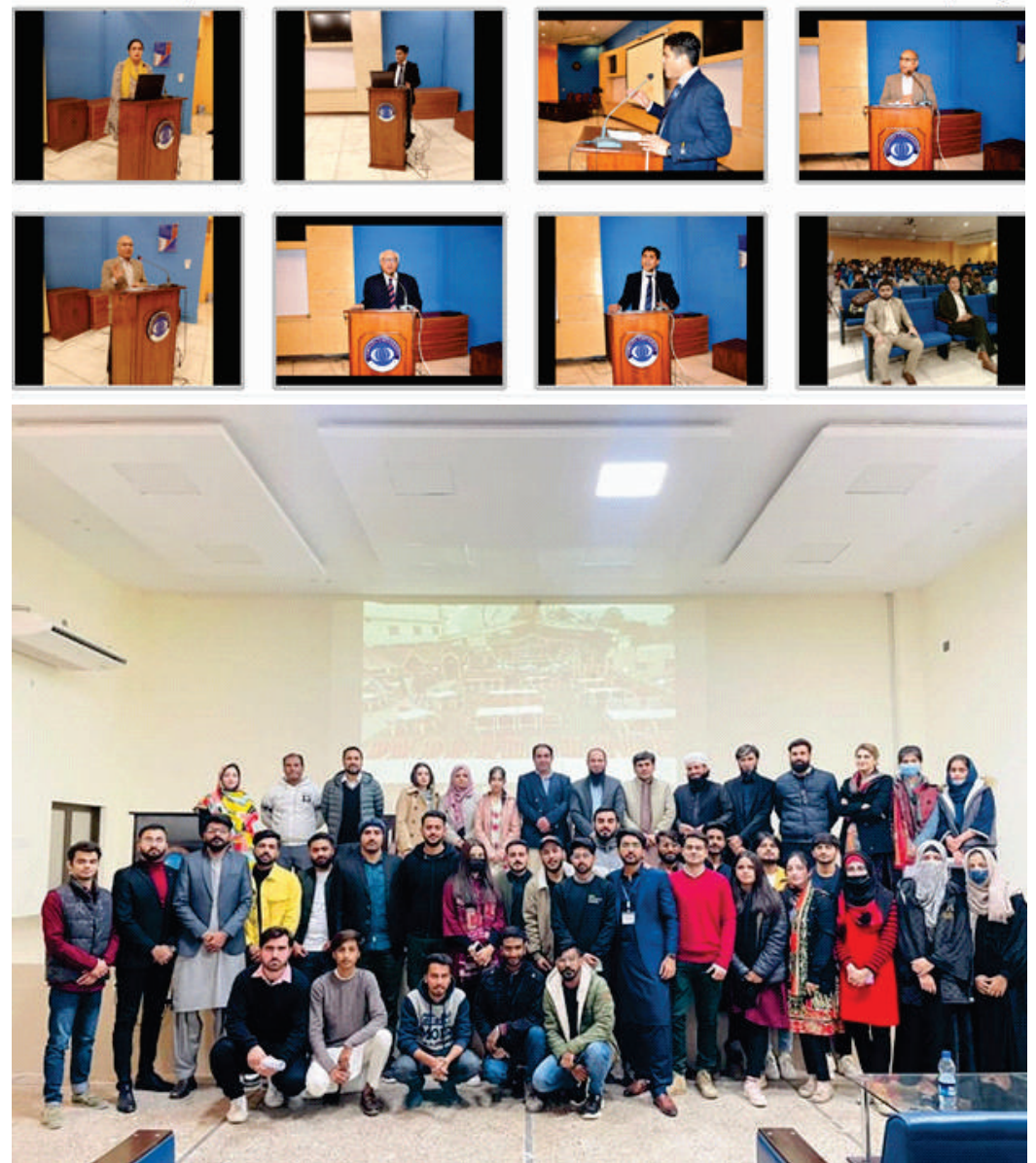
Seminar on "Iqbal and Jinnah's Vision of national education and our education policy"

philosophy failed to integrate morality in their political thought and institutions. Islam struck fusion between pure reason and revelation and spread like a prairie fire from Baghdad eastward to India, Transoxonia and further still and in the West to the very edge of the world. Today religion should be employed as a synthetic construct to combine metaphysics and social fact the great achievement of pristine Islam otherwise world stands on the threshold of utter annihilation. At the end head CPS presented souvenirs to honorable guests and thanked the participants for their valuable time.