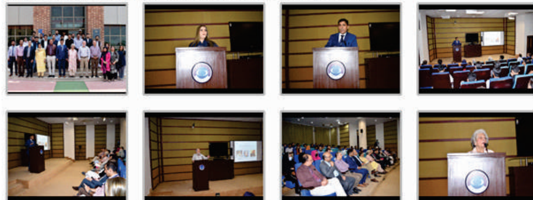
CPS Seminar on "Pakistan's being on the Cusp of South Asia, Central Asia and Middle East: Pearl, Perils and Pitfalls; crisis and Opportunities"