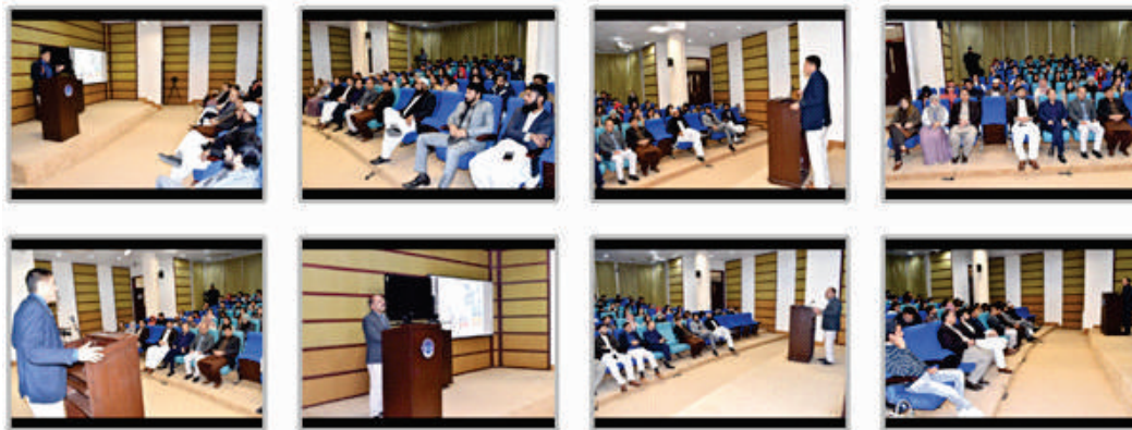
Jinnah: The Modifier of World Map and History, the Creator of Islamic State